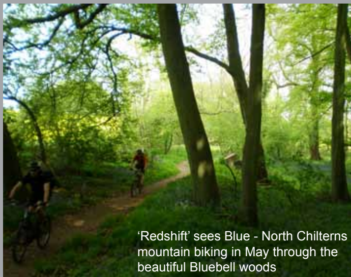
'Redshift' sees Blue - North Chilterns mountain biking in May through the beautiful Bluebell woods