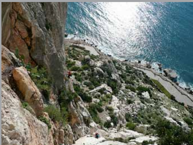
Costa Blanca, New Year 09/10, 4 pitches up!