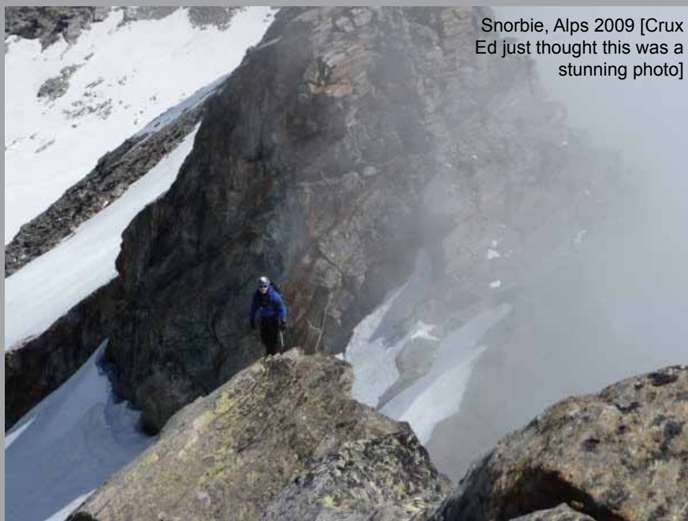
Snorbie, Alps 2009 [Crux Ed just thought this was a stunning photo]