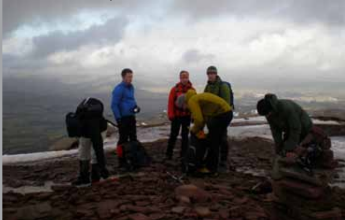
Summit of Pen y Fan, Brecon in Jan in a rare thaw for winter 2009/2010, but still cold.